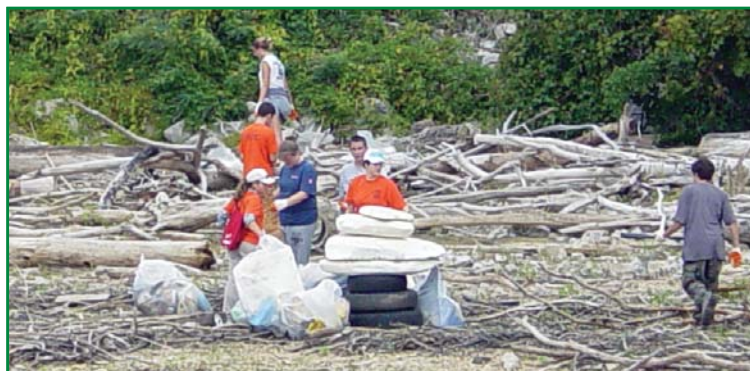
During the 2005 Lake Cumberland Cleanup, volunteers gathered trash to be transported by pontoon boat to the nearest of eight collection sites.

With 1,200 miles of shoreline, organizing a cleanup of Lake Cumberland was a large undertaking. There were eight registration sites in three counties and two volunteer appreciation picnics. Volunteers competed for a total of $3,200 in cash prizes.