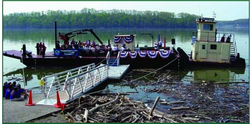
The PRIDE of the Cumberland was designed to pick up and chip wood debris, such as that seen in the lower right of the above photo, which was taken during the christening ceremony. On the boat were dignitaries from counties surrounding the lake, Kentucky government and the Corps of Engineers. In the lower left are students from the "E-Team" PRIDE Club of Meece Middle School (Pulaski County), who developed the "Adopt-A-Dock" program to encourage other schools and volunteers to help keep the lake clean.

The vessel was constructed by Advanced Industrial and Machine Works, which is based in Mobile, Alabama.